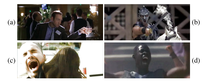
Fig. 2 . Sample frames for: (a) Low arousal, (b) High arousal, (c) Very negative valence, (d) Very positive valence.